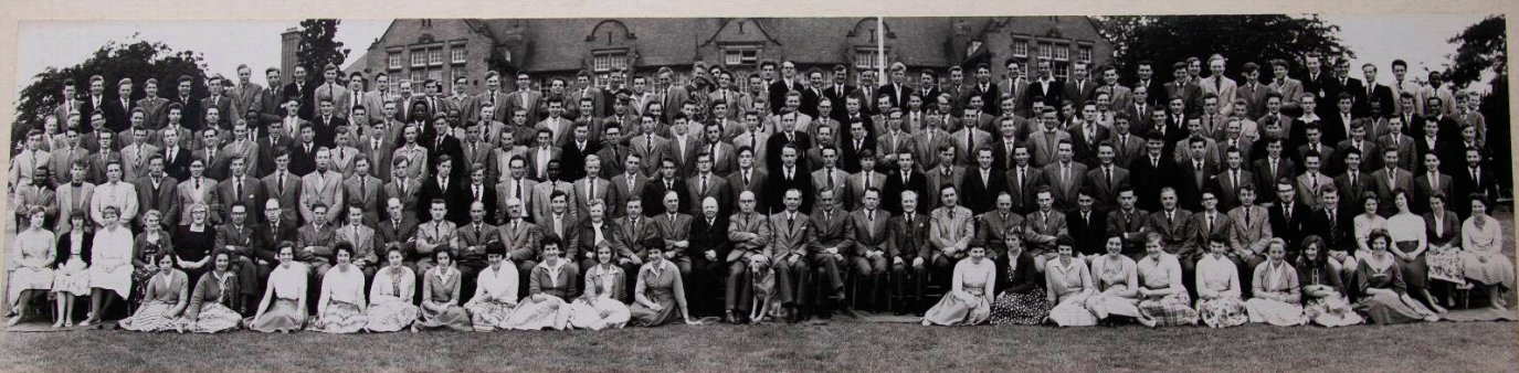
Top Row: ... Middle Row: ... Bottom Row: ...

Management and Business Administration, graduating in 1979. Spending her free time at the student bar and swimming pool, she carries fond memories of the nice atmosphere and sense of community at Harper Adams – something which is ever present in the modern day more than half a century down the line.