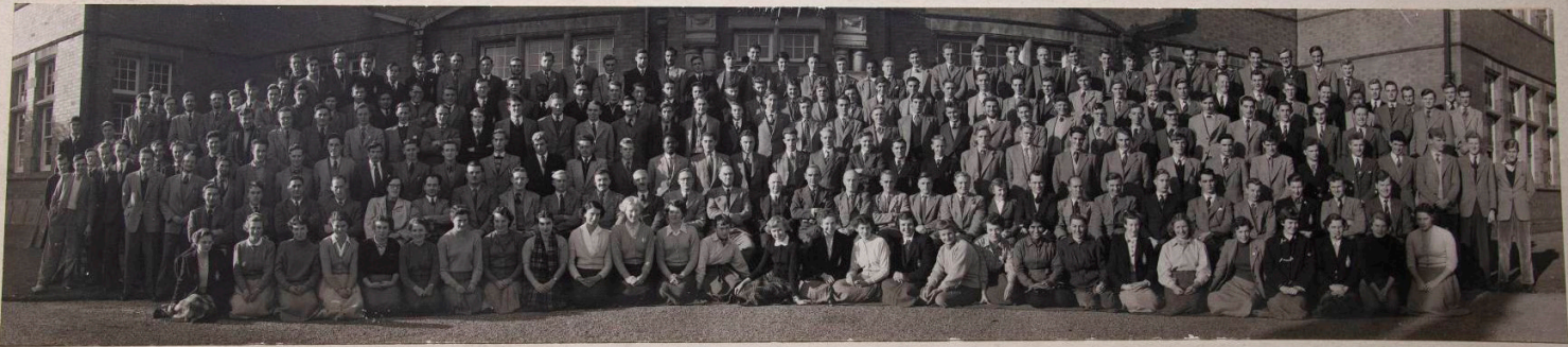
Top Row: ... Middle Row: ... Bottom Row: ...